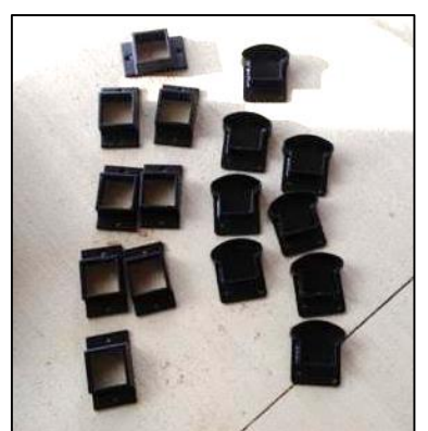
Step 1: Check over attachment hardware to ensure correct quantities.