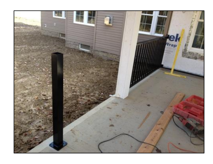
Step 2: Lay out posts in desired locations and cut sections (if needed) using a hacksaw or reciprocating saw.